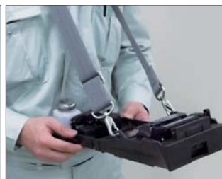
Sling & Splice!