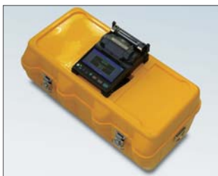
Place & Splice!