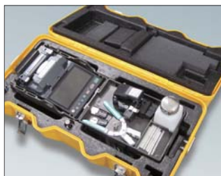
Open & Splice!

Fixed v-groove, Dual-axis observation system